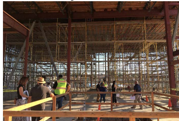
Looking into the church from the Baptismal font