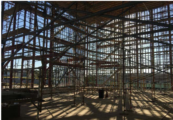
Scaffolding inside the spacious Church

If you already made your pledge to help build our permanent Church and Parish Center, THANK YOU! If you were waiting to see if we really would build a church before you made a pledge – NOW is the time!