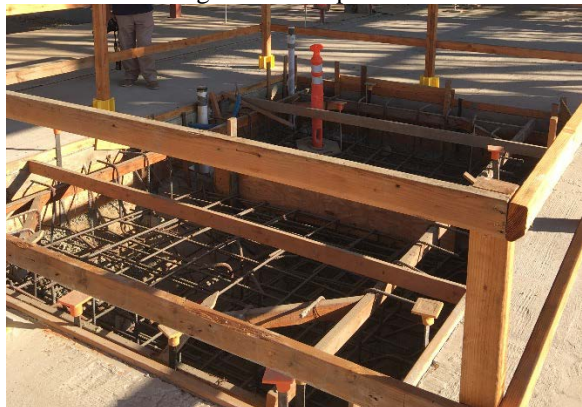
The recessed Baptismal pool and font in the entrance