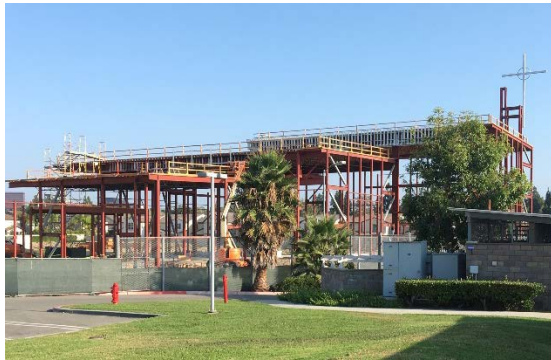
The three-tiered roof of our new Church

If you were waiting to see if we really would build the church before you made a pledge – now is the time!