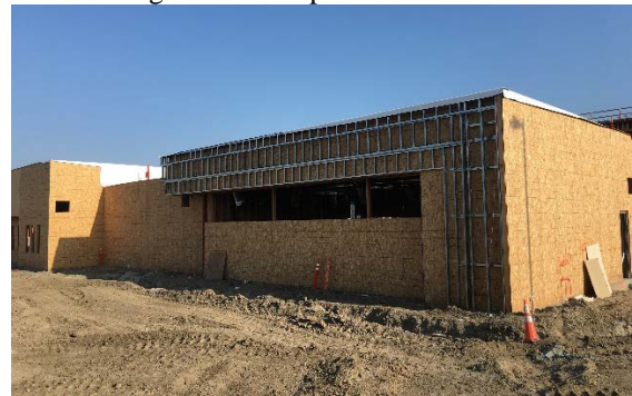
The Parish Center will also have a decorative fascia