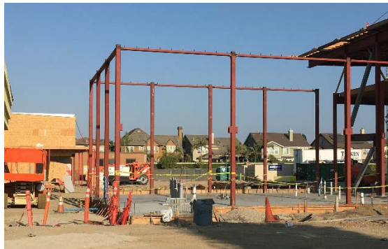
The Sacristy of the Church is now framed