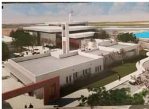
Parish Offices, Choir practice room & Worship space

Dios no envía las iglesias del cielo, deberán surgir de nuestros corazones. —Anónimo