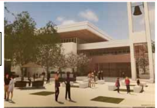
Courtyard with Bell tower