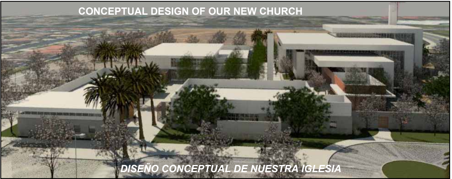
DISEÑO CONCEPTUAL DE NUESTRA IGLESIA