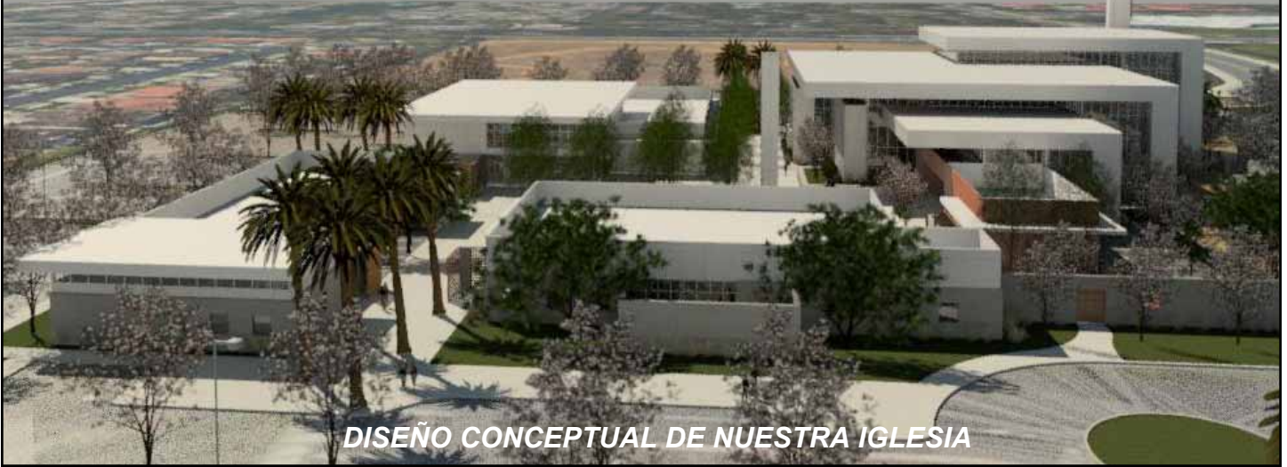
DISEÑO CONCEPTUAL DE NUESTRA IGLESIA